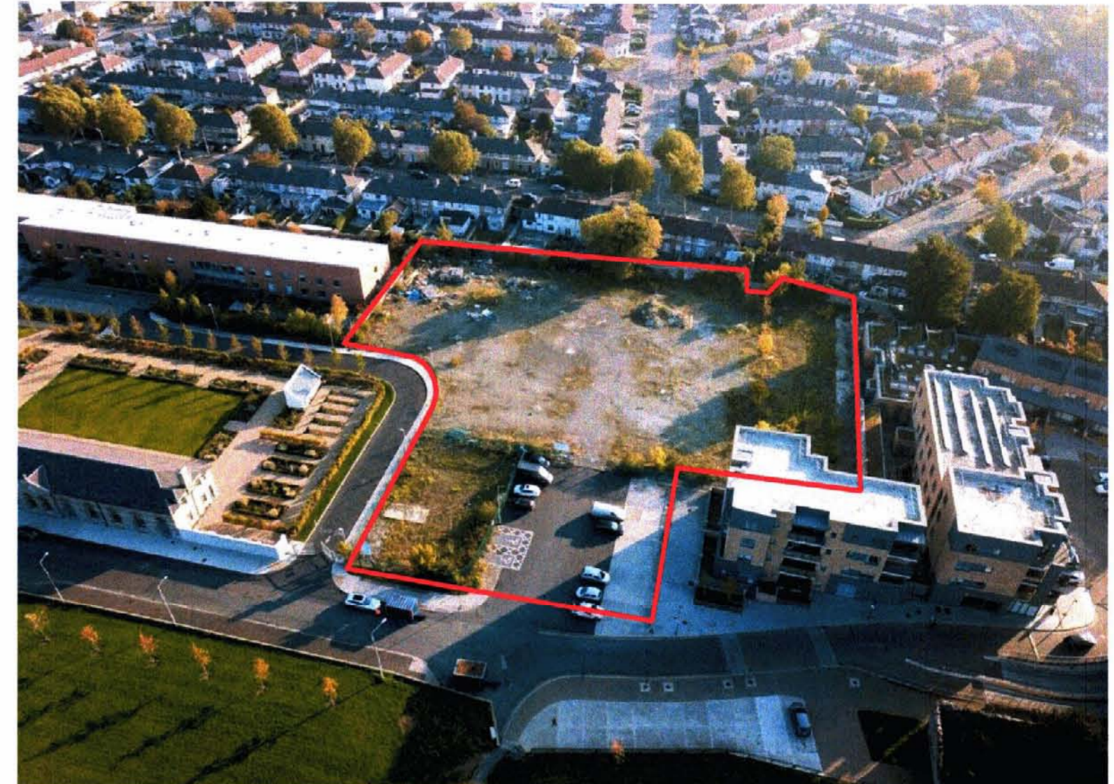
Aerial photograph of site looking East